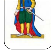
IL RE DELLA BRISCOLA